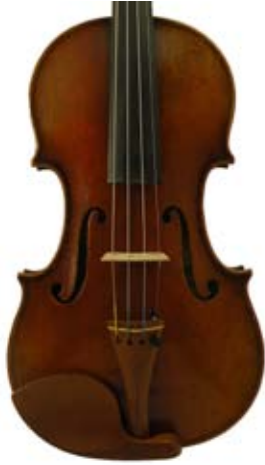
Violin - Full Size - $1950

Another new model from Eastman with antique varnish and excellent sound quality. The Pietro Lombardi is made with a beautifully flamed maple back and a highly select spruce top. The sophisticated amber colored spirit varnish of the Lombardi is reminiscent of Italian makers. Violins are available in Guarneri and Stradivari patterns.